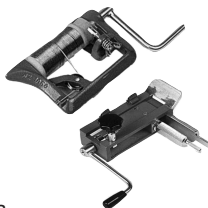
Fire Hose Binding Tool