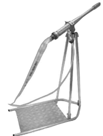
Hold Cleaning Gun with Platform