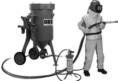
Sandblasters 100 ltr & 200 ltr

Tel: +30 210 4637120 / 4637121 Fax: +30 210 4637075 efodia@hol.gr