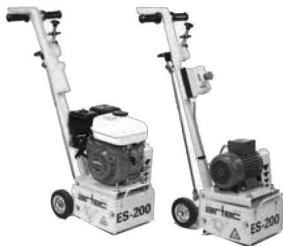
Deck Scalers 110V-220V-440V 200mm