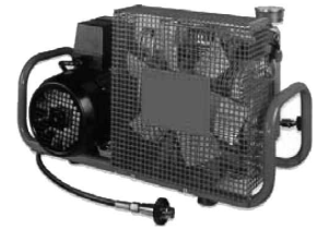
Breathing Air Compressors 300 bar, 110V-220V-440V