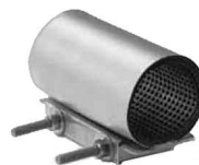
Pipe Repair Clamps 20mm to 600mm