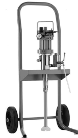
Airless Paint Sprayers 33:1 52:1 64:1 75:1