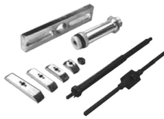
Valve Seat Cutters For 1" to 4" valves