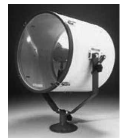
Suez Canal Searchlights 3000W lamp