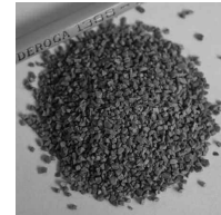
Walnut Shell Grit 12/20 for Turbo Cleaning