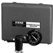
KIENE Peak Pressure Indicators Model K-100 (0-140 bar) Model K-107 (0-210 bar) Model K-108 (0-250 bar)