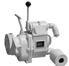
Air Motors, Portable Japanese & European Types 5.5 HP & 7.3 HP