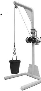
Mucking Winches 100kg-200kg-300kg