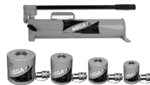
Hydraulic Cylinders & Pumps 700 & 1500 bar