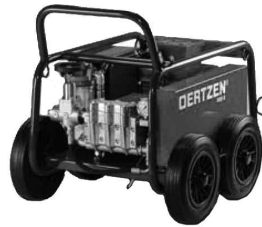
High Pressure Cleaners 200 bar - 500 bar