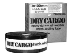
DRY CARGO Hatch Cover Tapes 100mm & 150mm