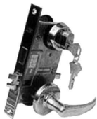
Japanese Style Mortise Locks with Lever Handles

2320 Cylinder Mortise Lock Key Outside, Thumbturn Inside 2220 Indicator Mortise Latch Green/Red Outside, Thumbturn Inside 2410 Lever Tumbler Mortise Lock with Deadbolt