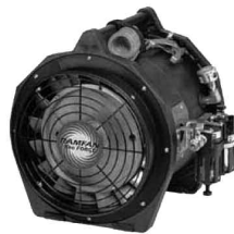
Explosionproof Ventilators Electric, Pneumatic or Water Driven 300mm or 400mm diameter