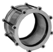
Flexible Pipe Couplings 50mm to 600mm