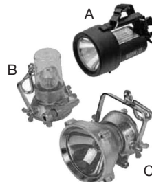
WOLF Ex-Proof Lights A: Model H-4DC Safety Handlamp Pneumatic Flood Lights B: Model A-TL44 C: Model A-TL45