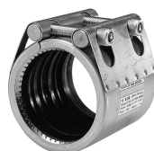
Grip Type Pipe Couplings 20mm to 300mm